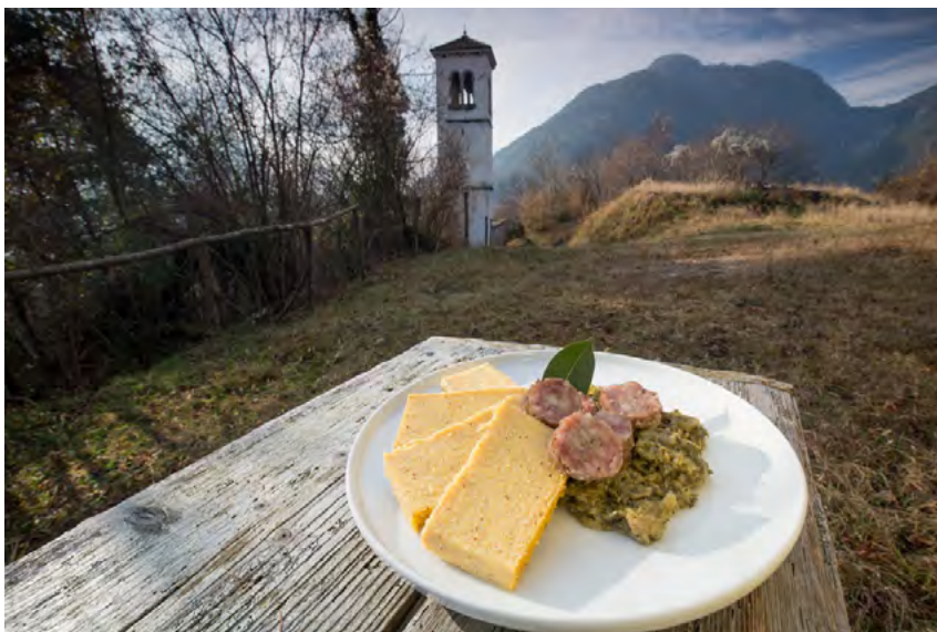
Local products from prealpi Giulie Nature Park, Moggio Udinese, Italy

In addition, European policies to raise consumer awareness, fostering an understanding and acceptance for higher product prices - thus, adequately remunerating services provided by farmers - are crucial.