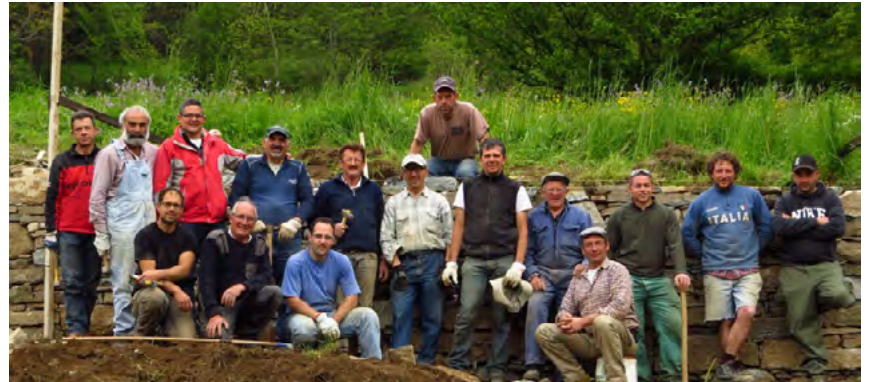
Farmers in Adamello Brenta Regional Park, Italy

Agri-environmental schemes and similar measures have to be reinforced and simplified. Protected Areas and Natura 2000 managing bodies should be seen as key-actors in these measures , and be supported to promote them among the local farmers.