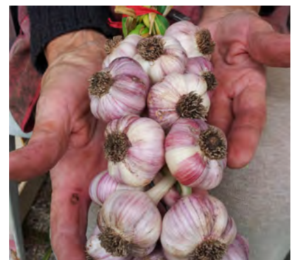
Locally grown garlic, Resia, Italy

In the application of CAP measures at national and regional levels, Member States and Regions have to respect the priorities and indications concerning environmental sustainability from EU: the goals for biodiversity and nature conservation have to be clearly integrated into the policy framework at all levels.